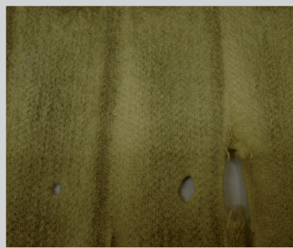
testing the causes of failures